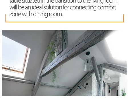
When separating functional zones in the attic look carefully at its shape. For this purpose, use recesses, natural sloping of the roof and presence of structural beams.

Small operational area of the studio requires proper interior design under the roof. A small table situated in the transition to the living room